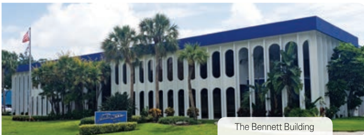
The Bennett Building